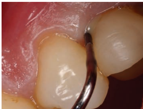
Figure 1. Probing an implant with a 9mm pocket with suppuration indicates the presence of infection.

Teeth: Probing depths of 1mm to 3mm are normal. A probing depth of