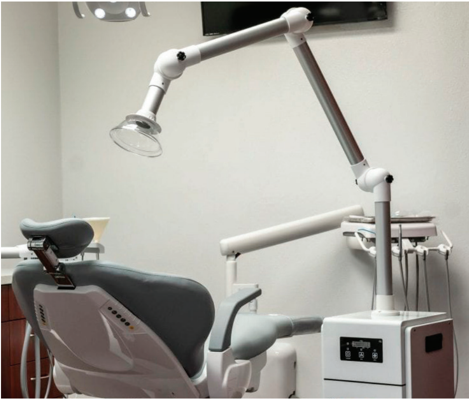
Figure 4. Extra oral suction systems efficiently minimize the risk of aerosol contamination.

that HOCL can be used in a fogger to sanitize entire rooms, surfaces, and PPE.