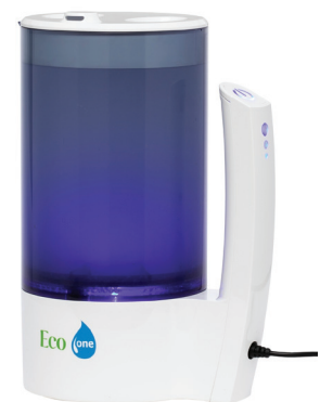
Figure 2. An inexpensive system used to generate hypochlorous acid (HOCL), which is a very effective disinfectant.

2. When scheduling or confirming appointments, screen all patients for symptoms of respiratory illness and contact with possible patients with COVID-19.