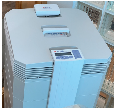
Figure 3. An air purifying/ filter system can be placed in each operatory.

4. When available, some offices are planning to use the Abbott ID NOW