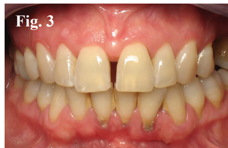
Figures 2 and 3. Patients who have had to postpone regular periodontal maintenance therapy can develop numerous areas of plaque and calculus, which leads to gingival inflammation and deterioration, and may possibly contribute to systemic disease.