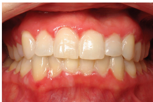
Figure 1. Personal stress and lack of appropriate care were the likely causes of acute necrotizing ulcerative gingivitis (ANUG) in this patient.

One study published in the British Dental Journal showed 20 percent of patients who were reported to have a severe form of COVID-19 had associated higher levels of inflammatory markers and bacteria. This suggests that poor oral hygiene be considered as a risk factor for complications from COVID-19, especially in patients with diabetes, hypertension or cardiovascular disease — comorbidities associated